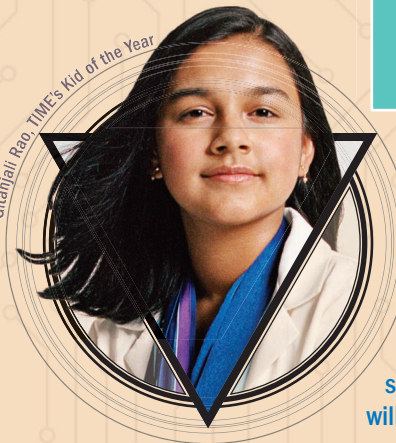
Gitanjali Rao, TIME's Kid of the Year

Each year, TIME for Kids picks the coolest and most helpful new inventions. Kid of the Year Gitanjali Rao, 15, is an inventor. This year, we let her take the lead. Gitanjali selected these items from TIME 's list of the 100 Best Inventions of 2020. Read what she has to say below.