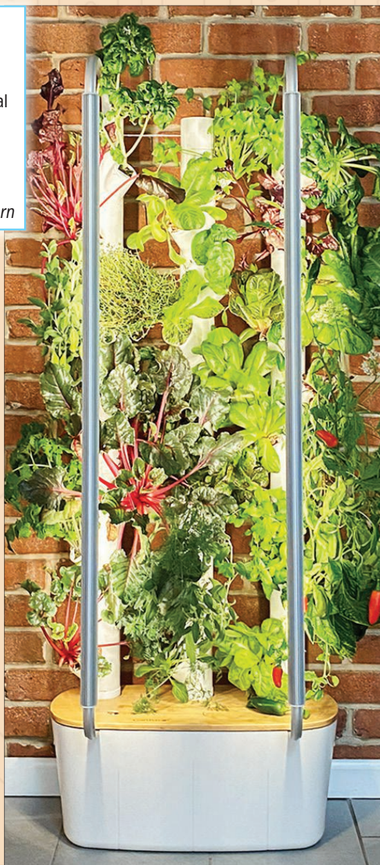
GITANJALI: SHARIF HAMZA FOR TIME. IMAGES OF PRODUCTS COURTESY BEST INVENTIONS COMPANIES (3)